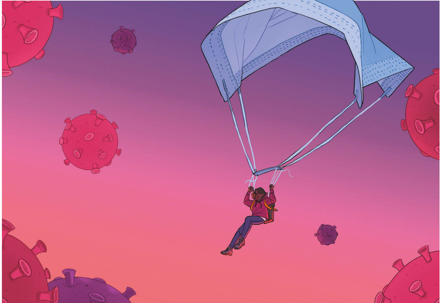
ILLUSTRATION BY BEX GLENDING