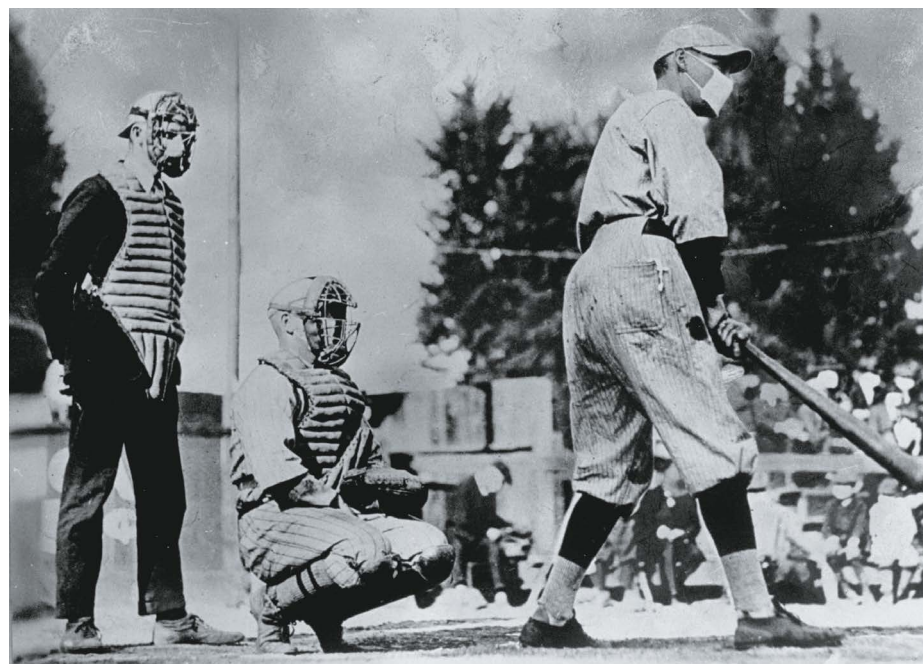
US baseball players wore masks while playing during the 1918 influenza epidemic.