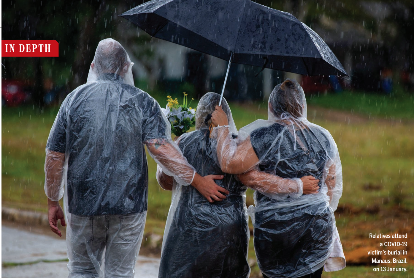
Relatives attend a COVID-19 victim's burial in Manaus, Brazil, on 13 January.